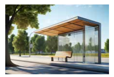
Bus stops and segregated areas