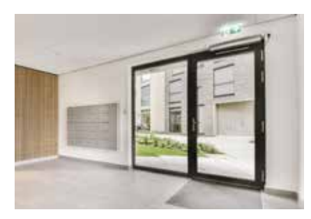
Doors and windows