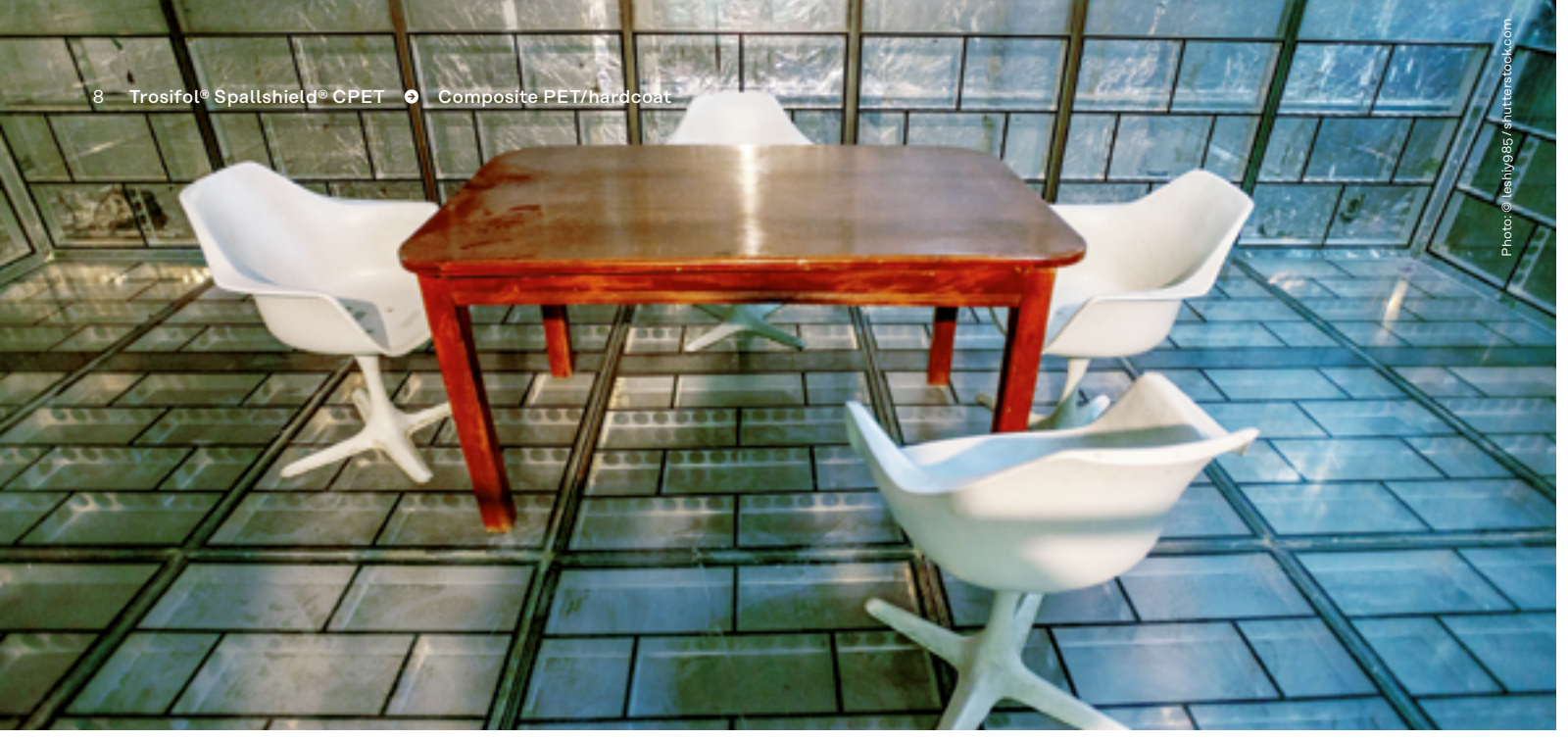
Glass room in former US Embassy