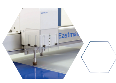
PVB - 0.088" / 2.28mm Drag Knife